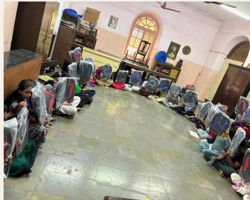
The Annual Event was filled with joy, alive with music, teamwork, and gifts.